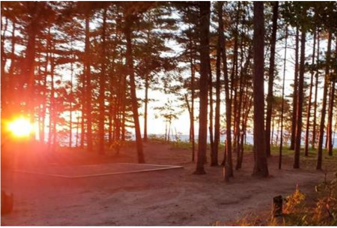
Twelve Mile Beach Campground, Pictured Rocks National Lakeshore, Grand Marais, MI

Psalm 1:1-3 (NRSV) Happy are those who do not follow the advice of the wicked, or take the path that sinners tread, or sit in the seat of scoffers; but their delight is in the law of the Lord, and on his law they meditate day and night. They are like trees planted by streams of water, which yield their fruit in its season, and their leaves do not wither. In all they do, they prosper.