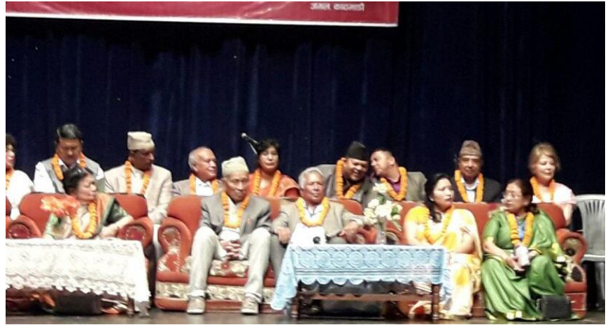
An awards ceremony.