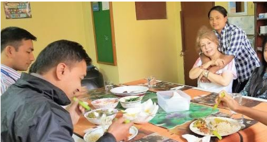
Visiting again the English Language Center to teach English.