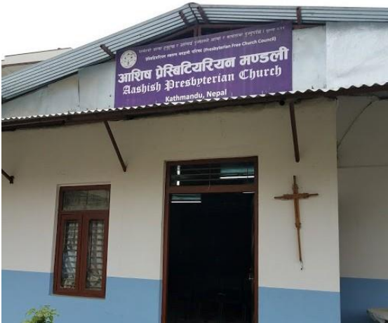
The Presbyterian Church is Growing.