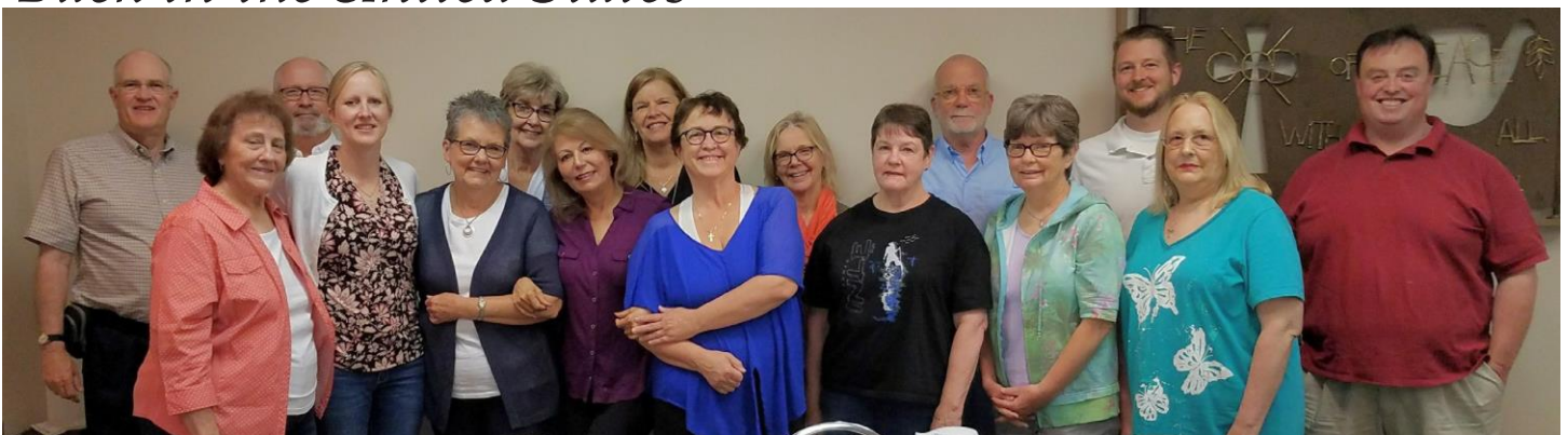
In Sioux Falls, Presbytery of South Dakota, attending "Coaching Skills 1."