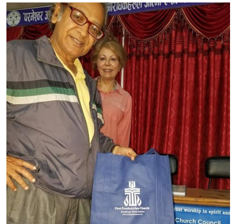
One Presbyterian pastor to another from across the ocean. A gift from First Presbyterian congregation to the congregation in Nepal.