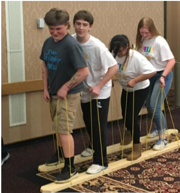
Team building exercise