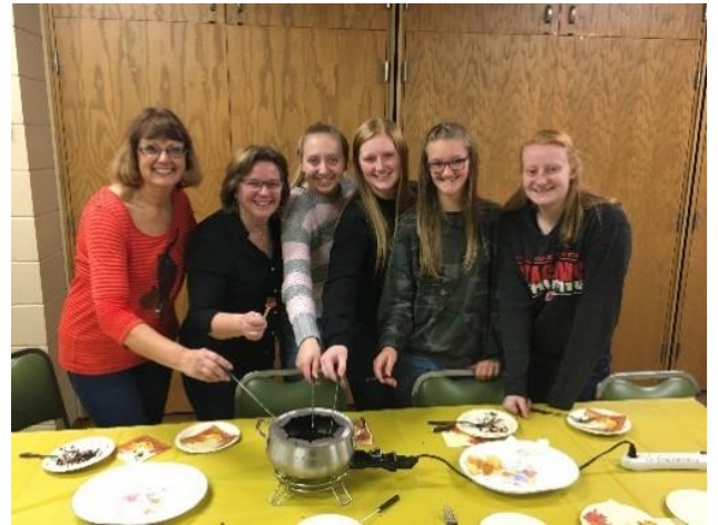
Dessert of chocolate fondue with strawberries, apples, cake, and marshmallows at the church.