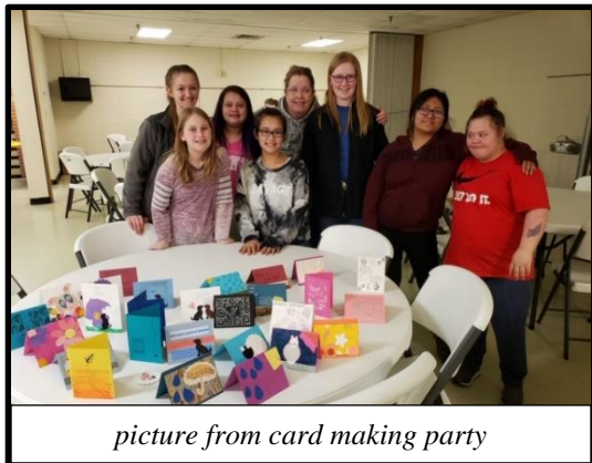
picture from card making party